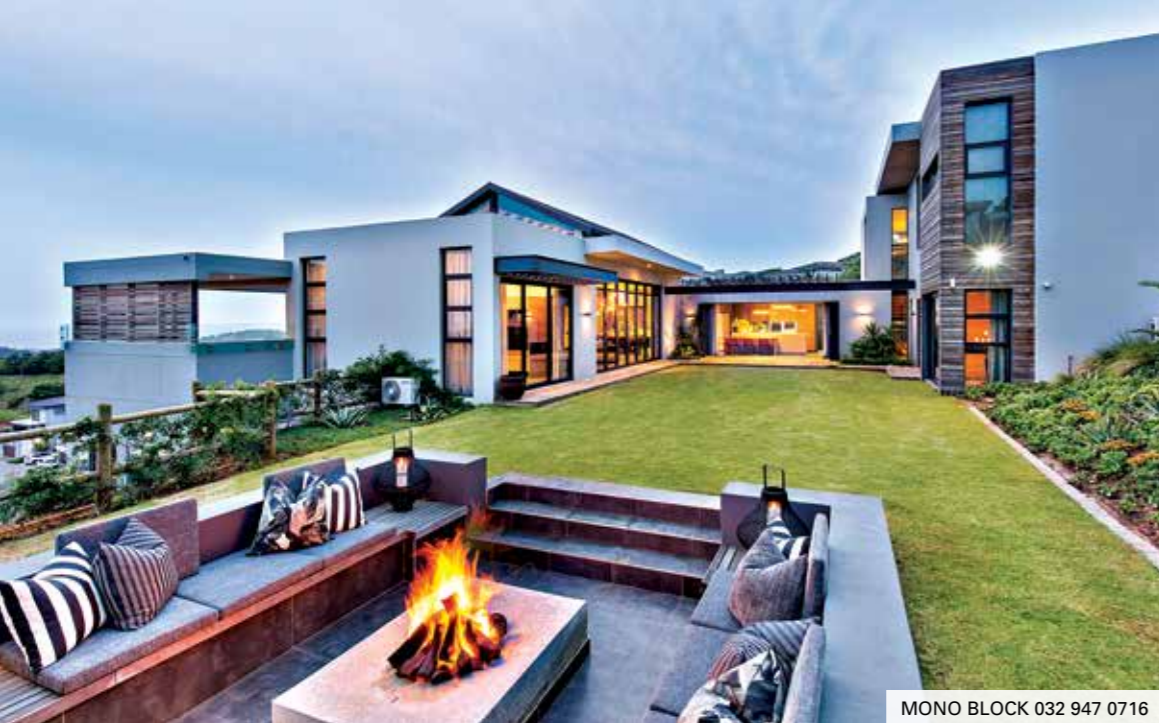
MONO BLOCK 032 947 0716

LEFT: Mono Block undertook the structural design of this grand home. Established in 1968, the company is renowned for its reputable product and service delivery. Mono Block specialises in civil and structural engineering design. In addition, it also provides the following services: precast cobbles, paving and flagstones; geotechnical and concrete laboratory testing, including Troxler, cube and pile testing; and suspended slabs and numerous precast concrete products.