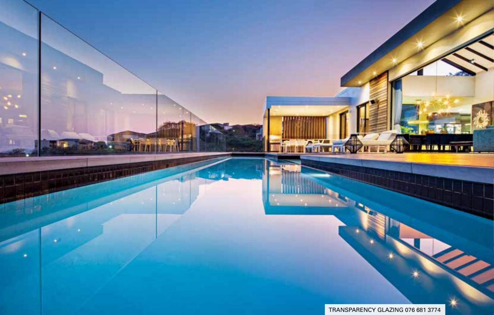
TRANSPARENCY GLAZING 076 681 3774