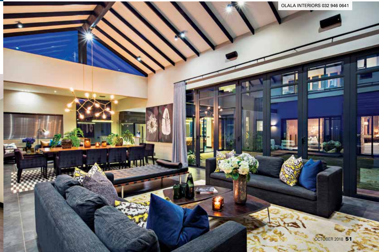
OLALA INTERIORS 032 946 0641

ABOVE: Transparency Glazing designed the glass structure that encloses the pool area. Frameless glass was used to create a space with an uninterrupted flow, while blurring the boundaries of the surrounding views. The company also supplied the frameless glass external balustrades as well as the frameless shower doors in this home.