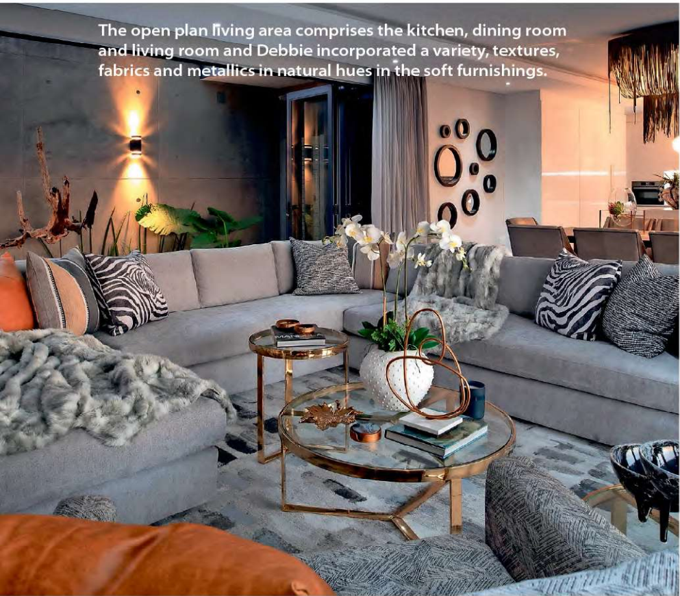
The open plan living area comprises the kitchen, dining room and living room and Debbie incorporated a variety, textures, fabrics and metallics in natural hues in the soft furnishings.