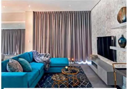
The master bedroom includes a comfy space to relax and watch TV with a drink after a long day