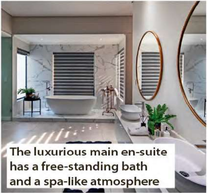
The luxurious main en-suite has a free-standing bath and a spa-like atmosphere

Details: Olala Interiors, Ballito Junction Regional Mall, info@olalainteriors.com, www.olalainteriors.com, 032 940 0399