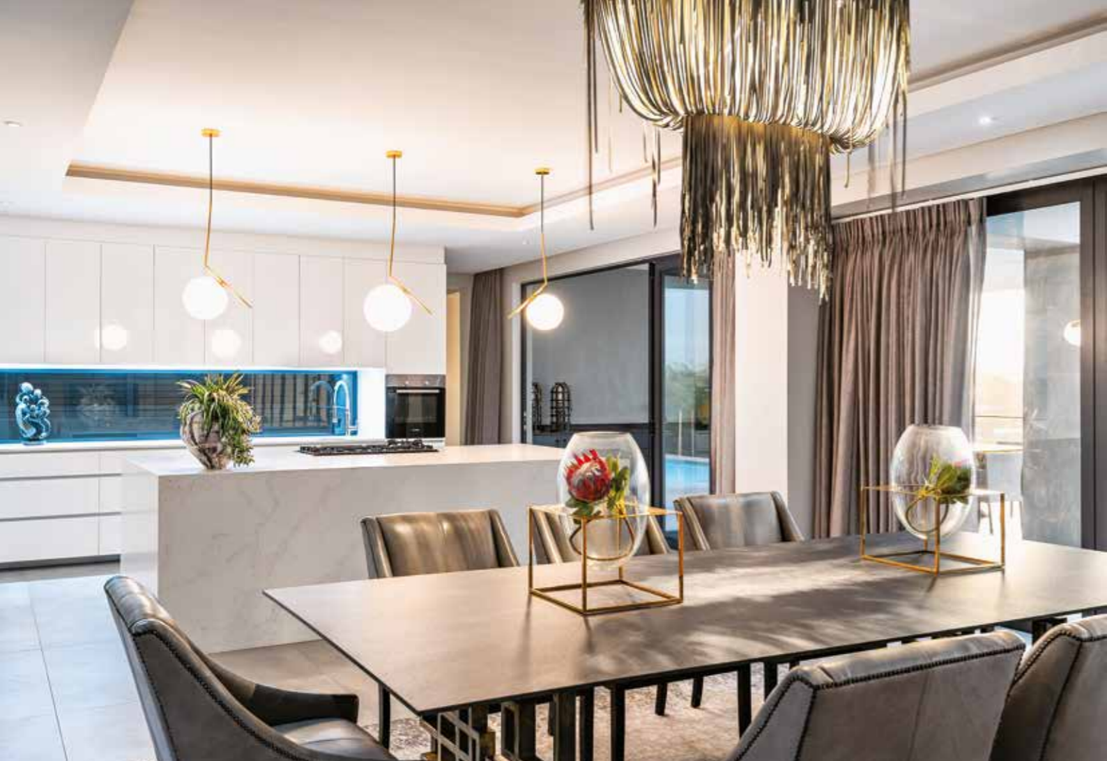
BELOW: With over 13 years in the industry, OLALA Interiors is an established firm that specialises in bespoke interior solutions for discerning clients who seek the essence of luxury living. Effectively capturing these home owners' vision, OLALA designed and manufactured the sofa, armchair, dining chairs and table (pictured here), and supplied all fabrics, leathers, décor, lighting and imported rugs.